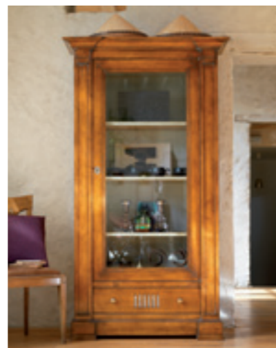
Vendôme 1333 Display Case (110 x 52 x 200cm), shelves mounted on toothed racks, glass door, one drawer.

The Vendôme collection perfectly expresses the skill of the craftsmen of Artcopi, a workshop located in the Vendée bocage. You just have to touch this furniture with your fingertips to realise that it has been made by cabinetmakers who respect the great traditions. Like the drawers, always assembled according to the age-old dovetail technique.