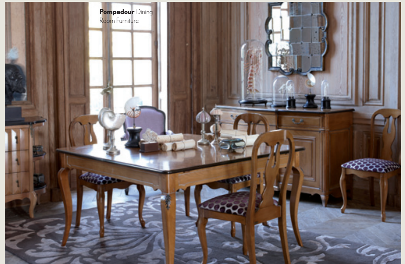
Pompadour Dining Room Furniture

beautiful furniture. The entire collection is imbued with this volition of the craftsmen to surpass themselves. This results in a quality of assembly, in a selection of the most beautiful woods, and in a finish that is conveyed by exquisite patinas, still produced by hand.