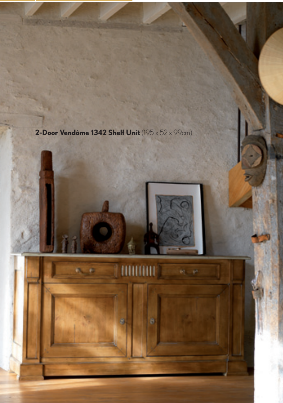
2-Door Vendôme 1342 Shelf Unit (195 x 52 x 99cm)