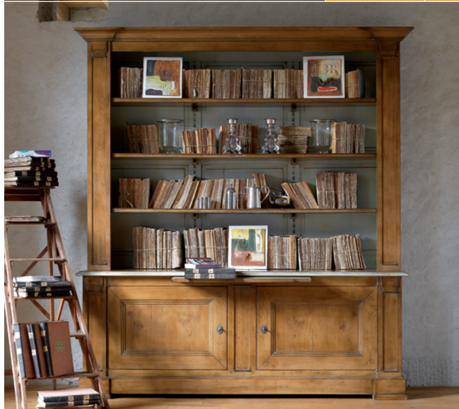
Vendôme 1342 Bookcase (202 x 220 x 50cm)