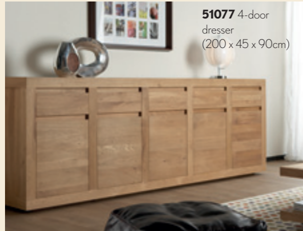
51077 4-door dresser (200 x 45 x 90cm)

Ethnicraft ® emotional ® wooden furniture