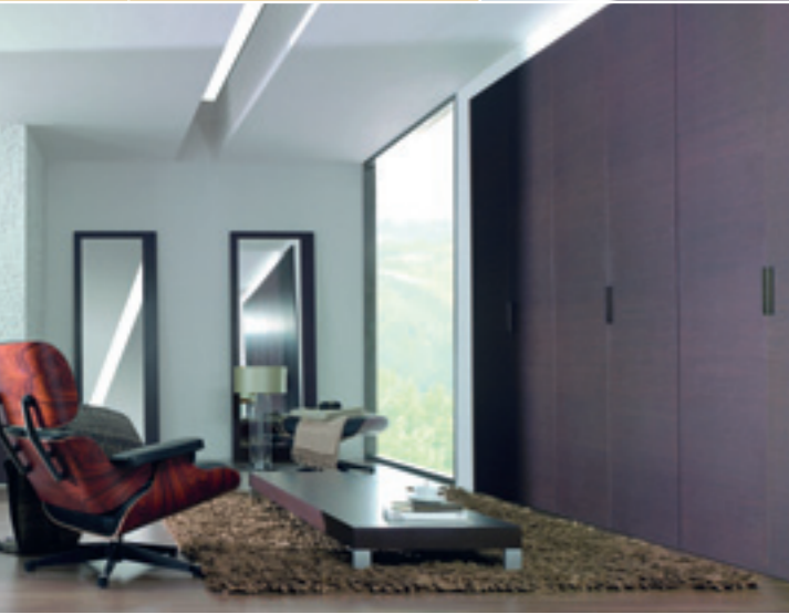
Unit equipped with Flat doors (multiples of 40 or 50cm)