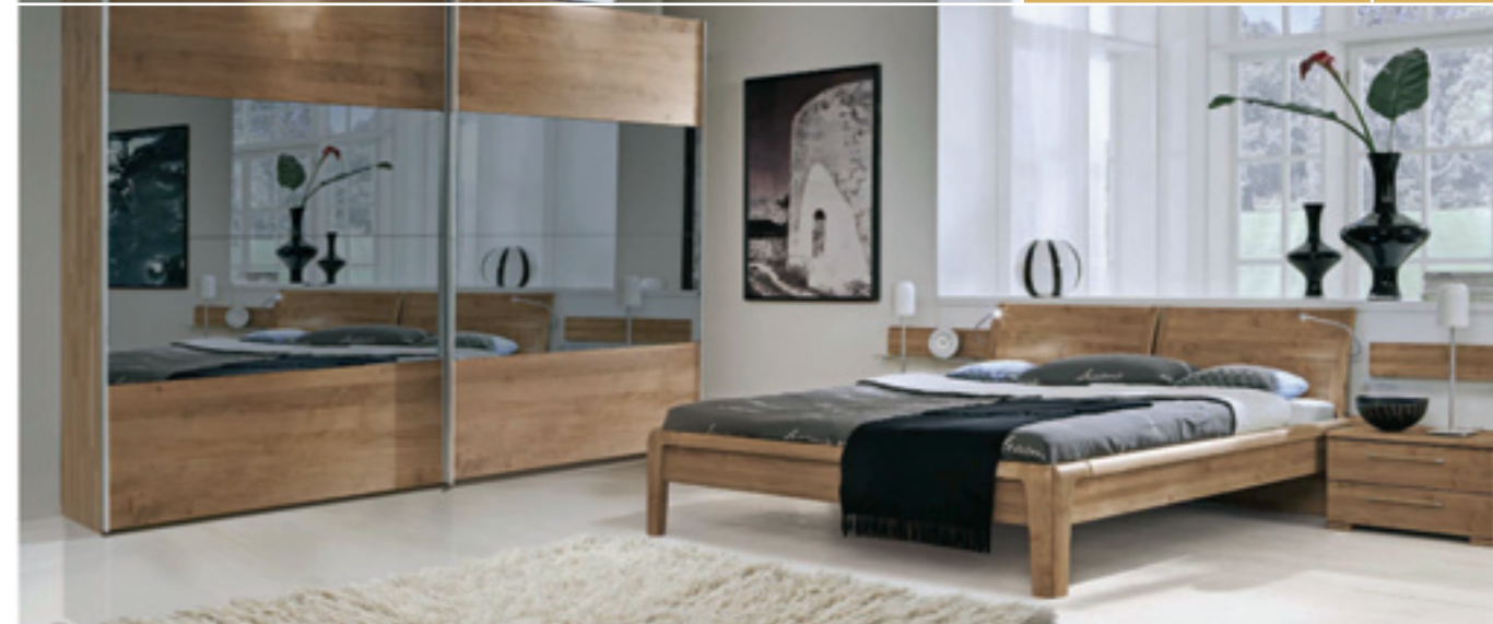
Cortina bedroom, in solid alder. Sliding or swing doors. Bed in widths of 140, 160 and 180cm.

Laredo bedroom, beech, ash or walnut finish. Door fascias, bed frame and bedside table being able to be produced in white lacquer or bleached thurshwood. Cupboard in heights of 226 or 243cm. Bed in widths of 160, 180 and 200cm.