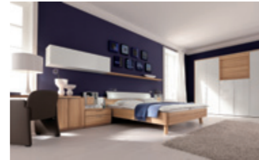
LA VELA 2

The choice of a bedroom is so personal that it is to better take your time, and to settle on your choice only after you've discovered all the facets of the HULSTA collection. Apart from the dimensions and the storage possibilities, the choice of finish is essential. It undoubtedly conditions our rhythm of life, by the choice of the colours. Is it not said that we spend nearly a third of our lives in bed?! Discover the HULSTA collection at Au Bon Repos: it's the certainty of being able to examine, in detail, a selection of this famous German brand's most beautiful bedrooms.