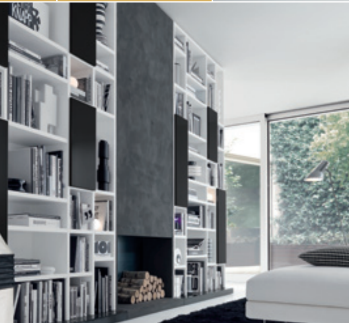
Open Wall Unit

Gap storage programme with swing doors of 37, 47 or 57cm. Available in four different heights (232, 242, 255 and 261cm). Embedded handles. JESSE is pushing the concern for detail here by offering a choice between two colours for the interior finish of the cupboards. What more could one ask?